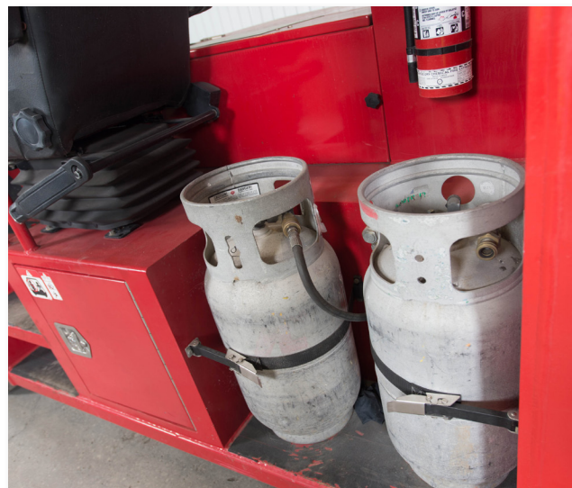
Very Low Lift LP Tank Loading. Improves safety immensely.