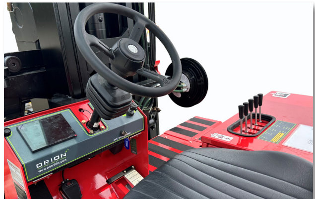
Tilt-steering, ergonomic seating, easy-read, light-touch controls