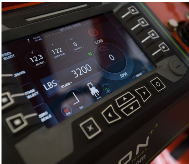
Easy-Read Load Scale. Keep track of how much you've lifted.