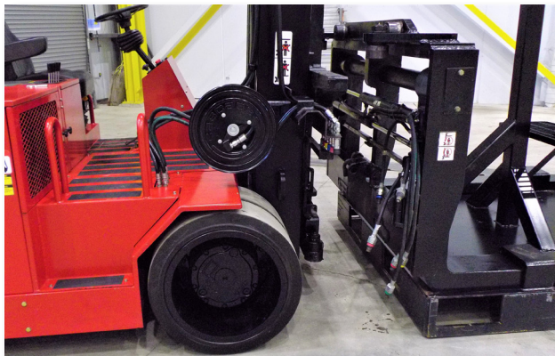
Orion Quick-Change (Boom to Forks in < 10 min.)